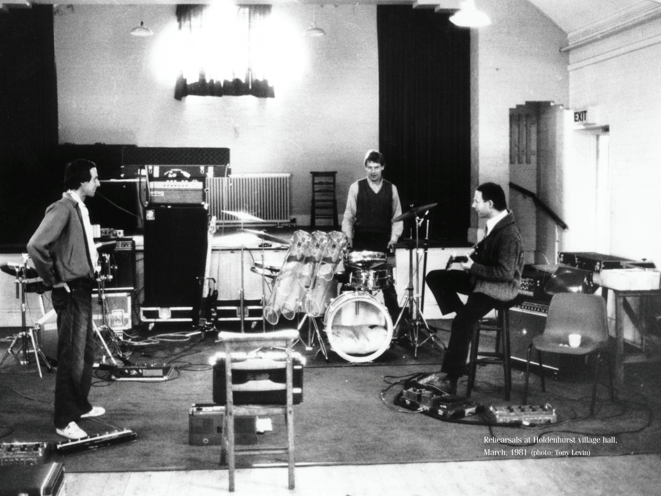
Rehearsals at Holdenhurst village hall, March, 1981